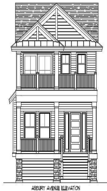
WORKING PLANS July 22, 2025